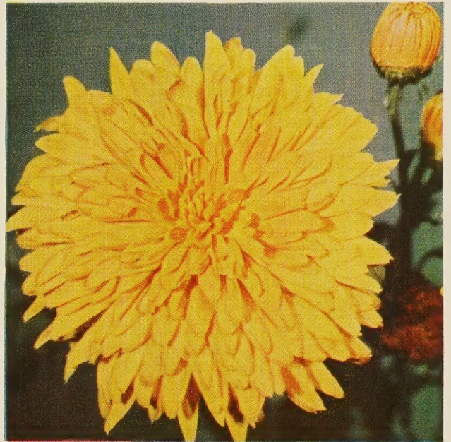
HOLIDAY. 75c each; 3 for $2.00